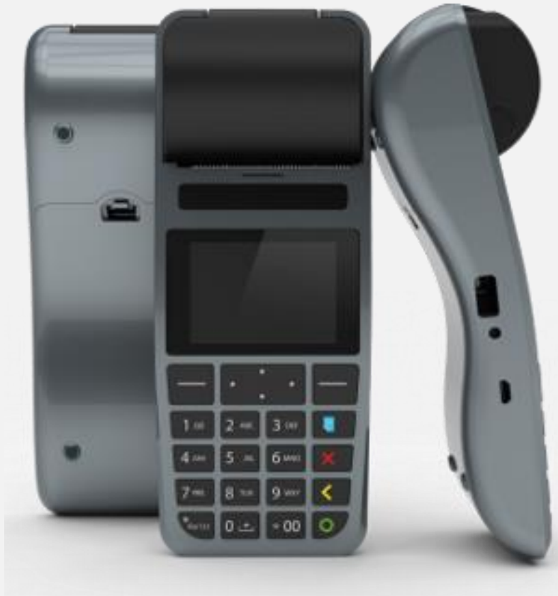
MobiPrint2 R1495 incl vat