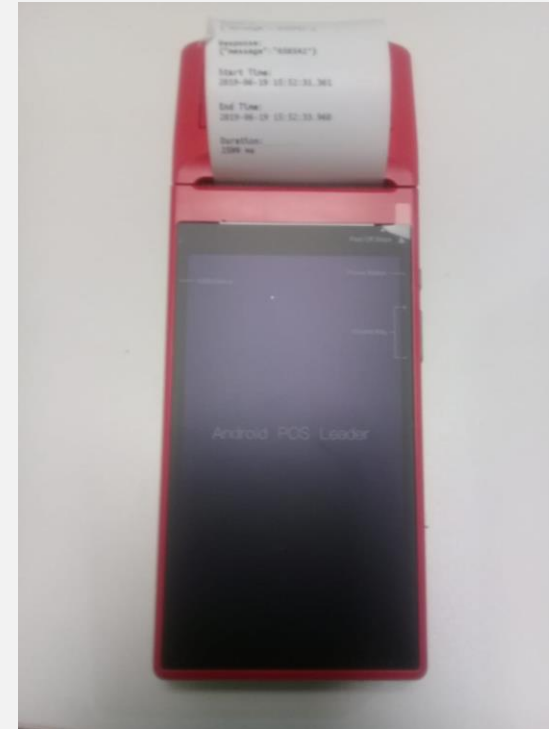
Timpa 3 Touchscreen R2799 incl vat