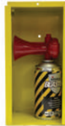
Loud & Clear Evacuation Alarms