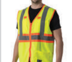
H&S Reflective Bibs