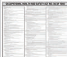
OHS Act Posters