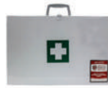
First Aid Regulation 7 Metal Boxes

VISIT OUR ONLINE STORE www.absolutehealth.co.za