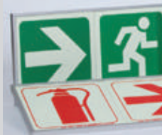
SABS Photo-Luminescent Signs