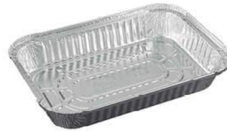
D8S (40% more resistant) ● hot ● cold