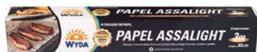
bake light paper (roll) ● hot ● cold