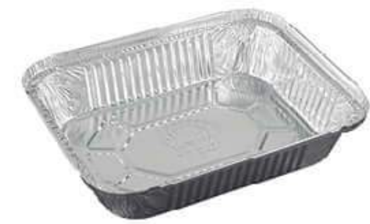
D5S (40% more resistant) ● hot ● cold