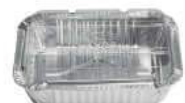
D12FS ● hot ● cold