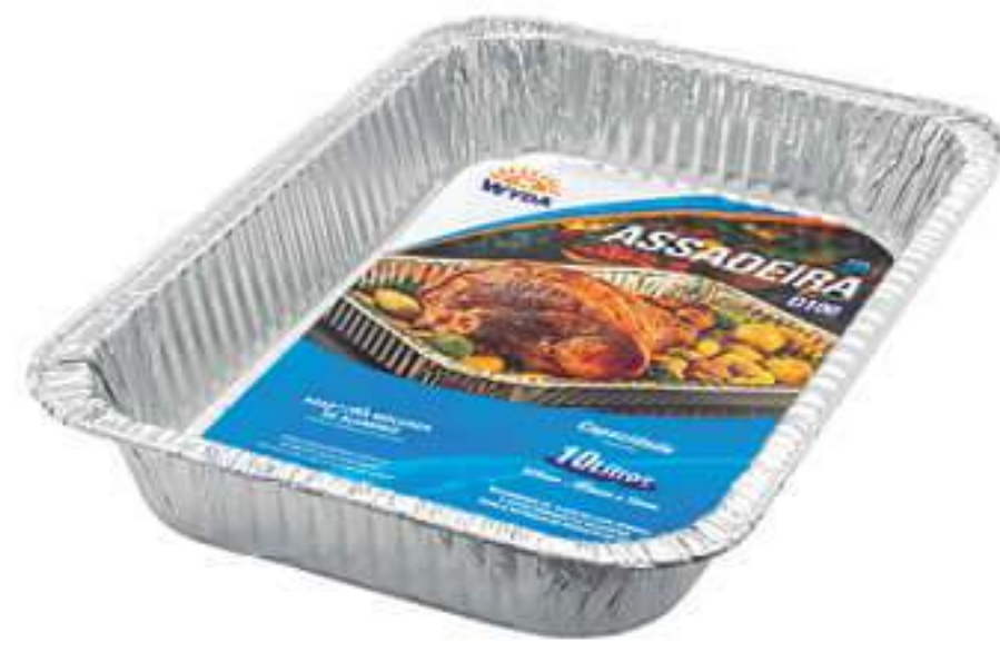
rectangular baking pan (10,000ml) ● hot ● cold