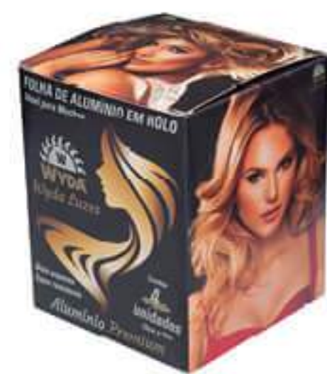
aluminum foil (roll) ● hot ● cold