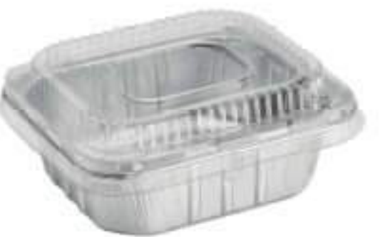
SW783 (food service premium) ● hot ● cold