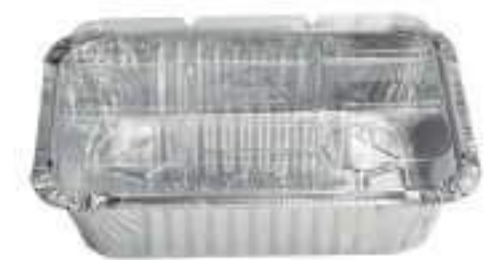
D6FS ● hot ● cold