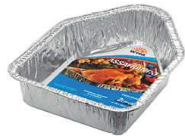
baking pan for chicken (2,000ml) ● hot ● cold