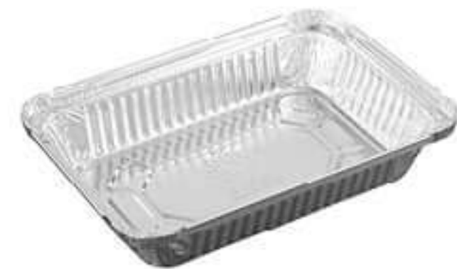
D7S (40% more resistant) ● hot ● cold