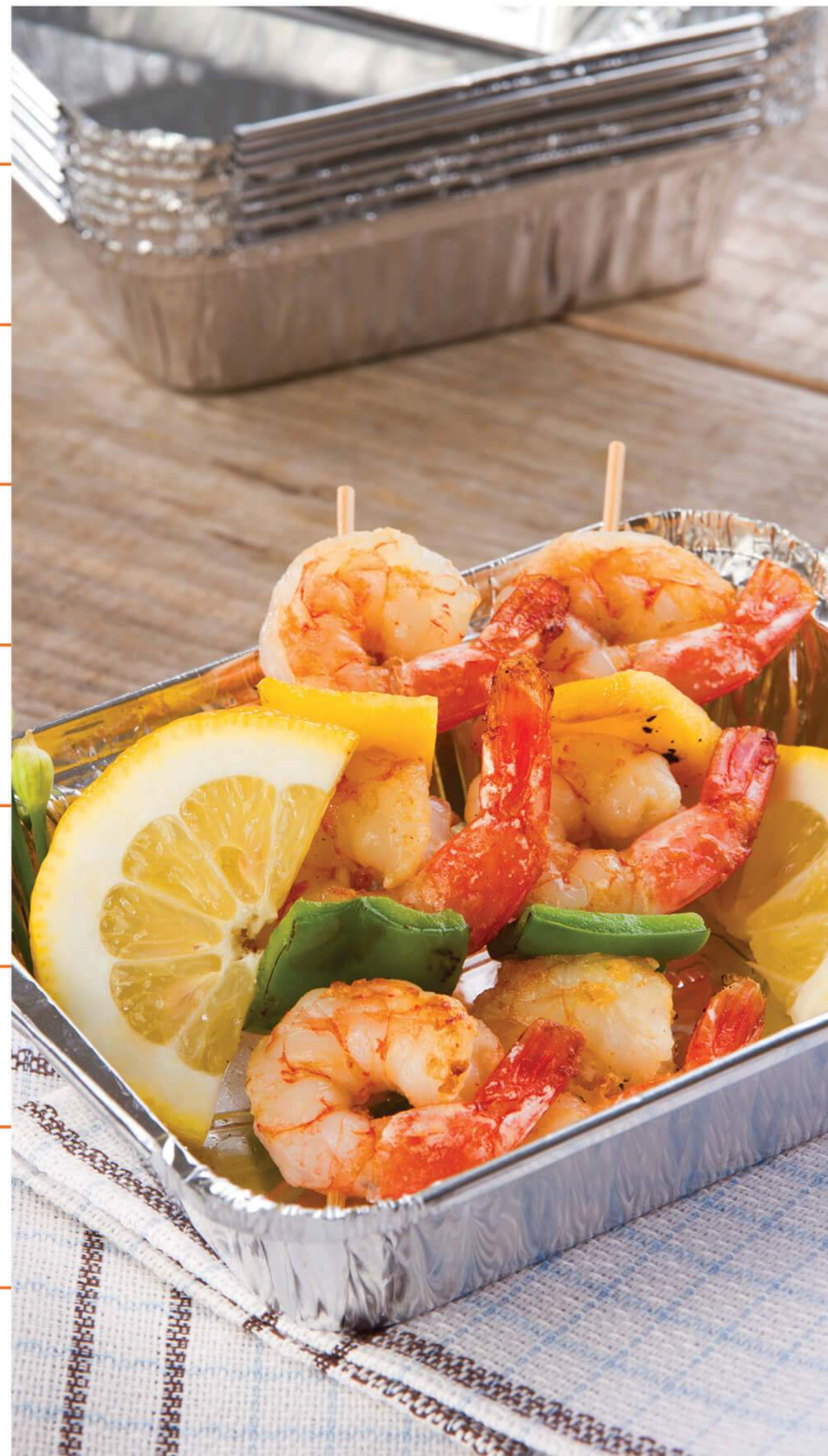
D1 ● hot ● cold