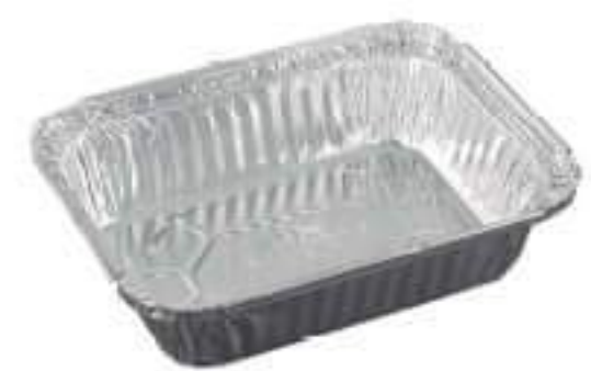
D6S (40% more resistant) ● hot ● cold