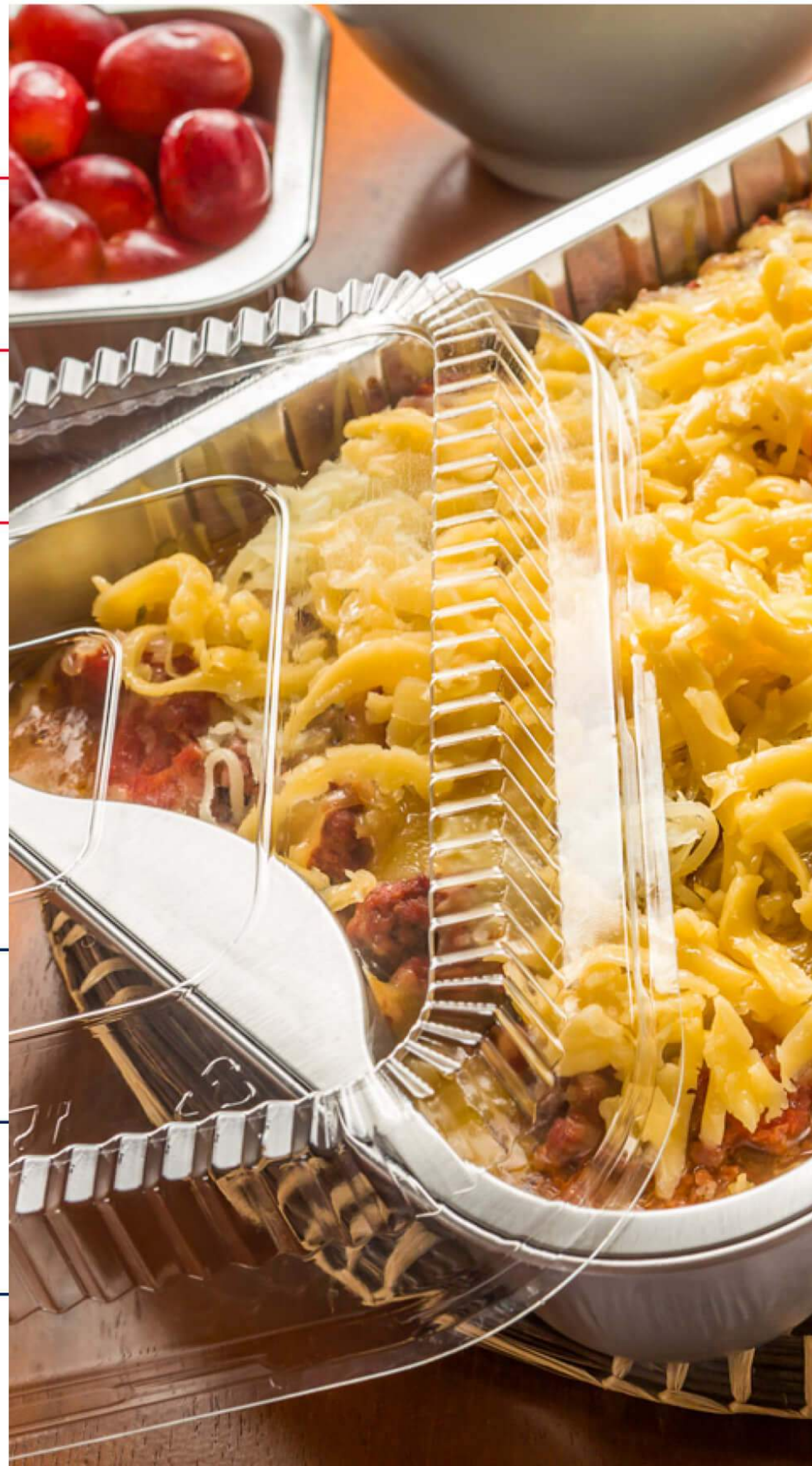
WCake (bake a cake) ● hot ● cold