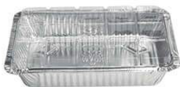
D7FS ● hot ● cold