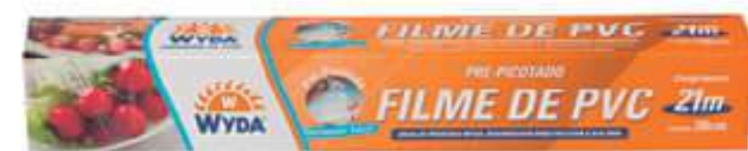
PVC film (pre-perforated) ● cold