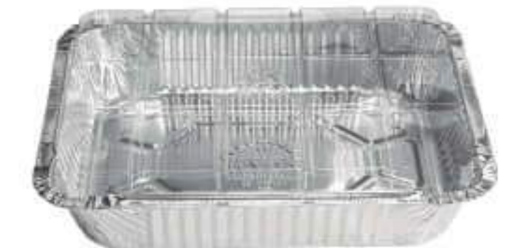
D5FS ● hot ● cold