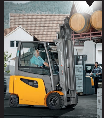
Precise handling of special loads with the EFG 425k .