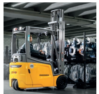
Extremely manoeuvrable , even in the tightest of spaces, thanks to 180° rotations on the spot.