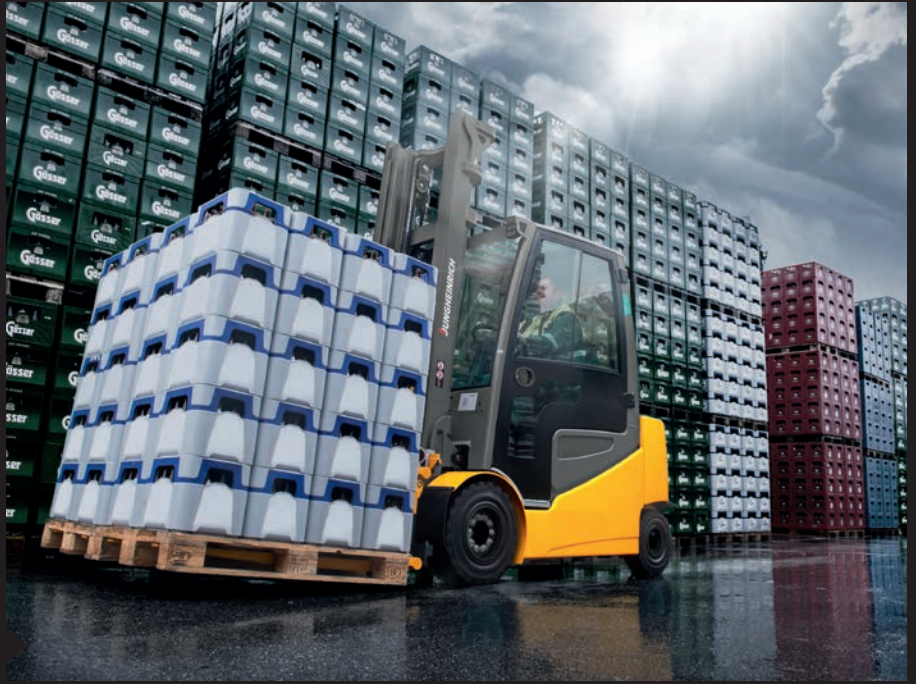
EFG 430 for industry-specific applications.