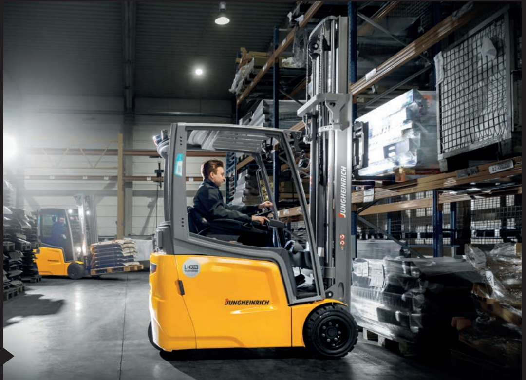
The powerful hydraulic system enables the EFG 216k to achieve very high lift speeds.