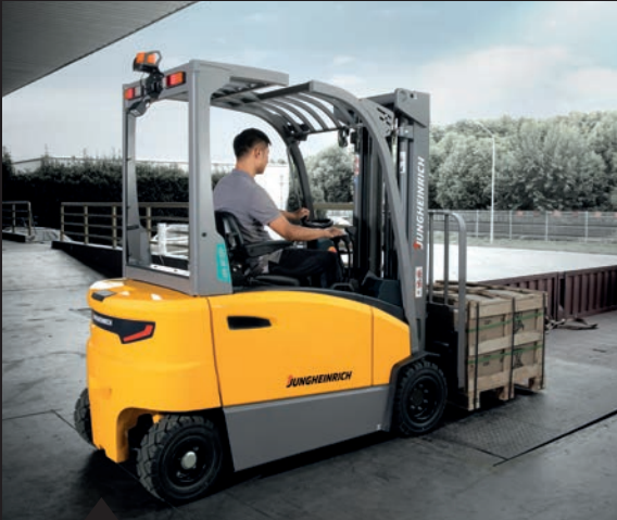
EFG BC 320: Intelligent Jungheinrich controller for maximum goods throughput.