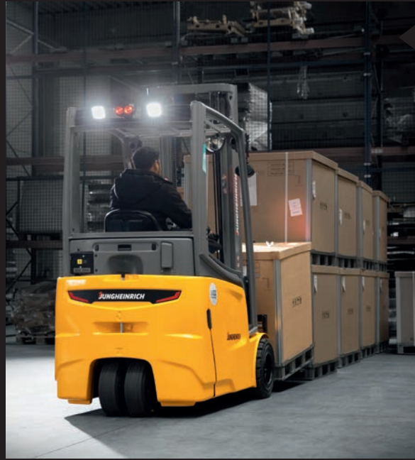
Energy recovery with regenerative braking on the EFG 112 .