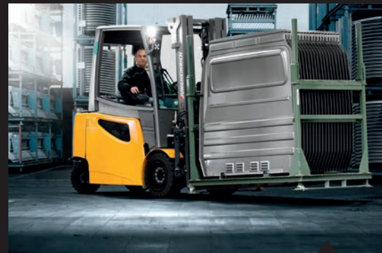
EFG 425 with minimal vibrations thanks to decoupling of cab and chassis.