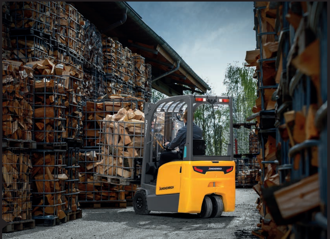
EFG BB 216k: Compact design for maximum flexibility in tight spaces.