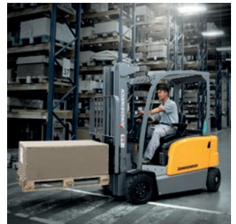
curveCONTROL assistance system for added safety when cornering.