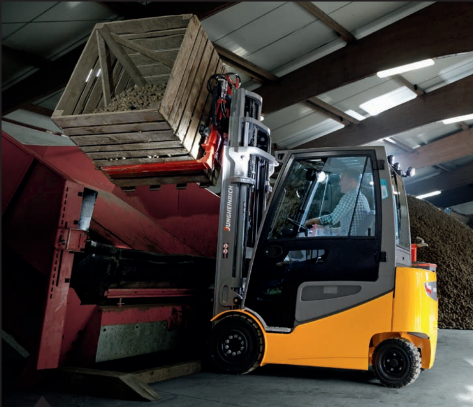
EFG 425k with a special rotating device.