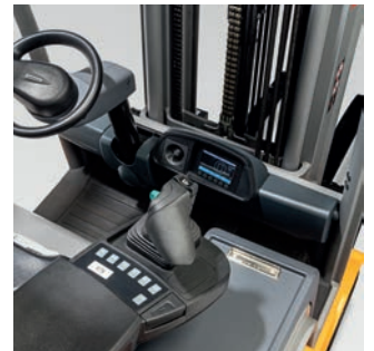
The ergonomic cockpit supports efficient working and protects the operator.