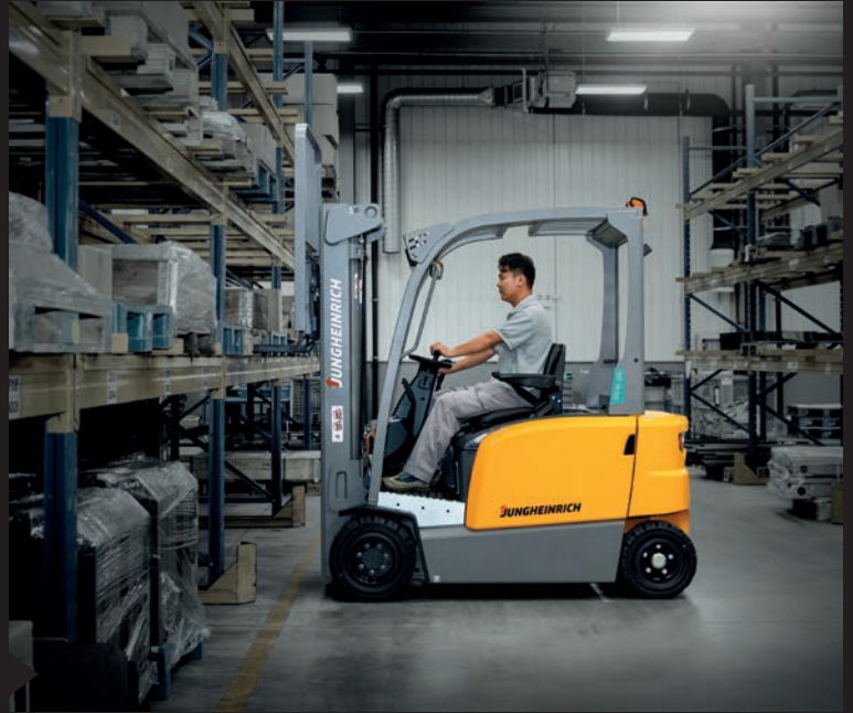
EFG BC 320: Robust mast quality and high residual capacity up to 5 m lift height.