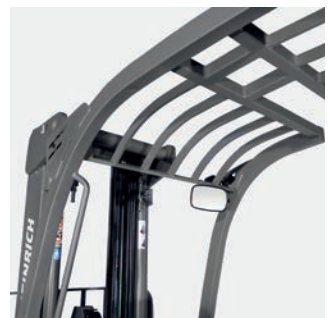
Arched overhead guard for optimal visibility typical of the BB and BC series.