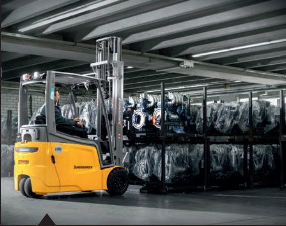
The EFG 216k – compact mast for perfect visibility.