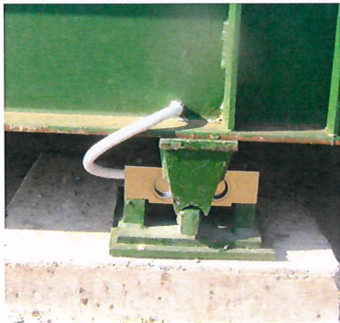
An installed Load-cell assembly

PSA-6808SA-100 IIL 5,000 Double-ended Shear Beam Load Cell alloy steel construction and is nickel-plated and hermetically (airtight) sealed. The PSA-6808SA-100 IIL 5,000 is reliable, simple to install and provides a high accuracy reading suitable for all kinds of environments with built-in lightning protection. Each load cell has a capacity of 34/45 ton, allowing for maximum point and axle loading. The PSA-6808SA-100 IIL 5,000 is approved to 3000d with a 0.02% combined error, analogue, operating range -10 to +40 degrees centigrade, maximum safe overload 200%. There are no joints or plugs anywhere in the system. Failure due to moisture ingress is totally obviated. Each load cell has 4 sensitivity weighing points.