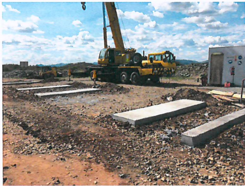
Concrete blocks 0,7m X 4,0m

All concrete to be ready mix, 25MPA. This design is based on a ground load bearing capacity of 150 Kpa and more. Should the ground be softer, compaction will be necessary. Should special compactable gravel have to be brought to site, the gravel and transport thereof are not included in the quoted prices A civil drawing will be supplied with all the relevant information.