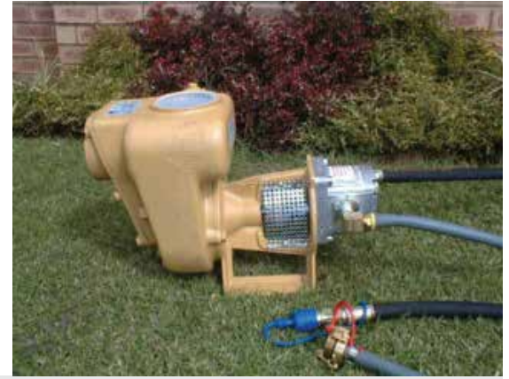
GMP 3" CAST IRON CHEMICAL PUMP

PERFORMANCE 1000 l/min at transfer 100 l/min at 2.5 bar