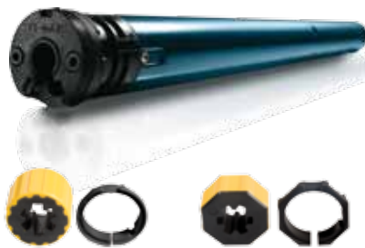
Wheels and crowns for cylindrical and octagonal tubes.

Roman blinds are sophisticated, contemporary window coverings that come in many styles; from understated modern styles right through to the lavish and luxurious. Somfy motorisation is ideal for Roman blinds as it removes the need for unsightly pull cords and keeps everything fuss free and simple to use. Just as you intended!