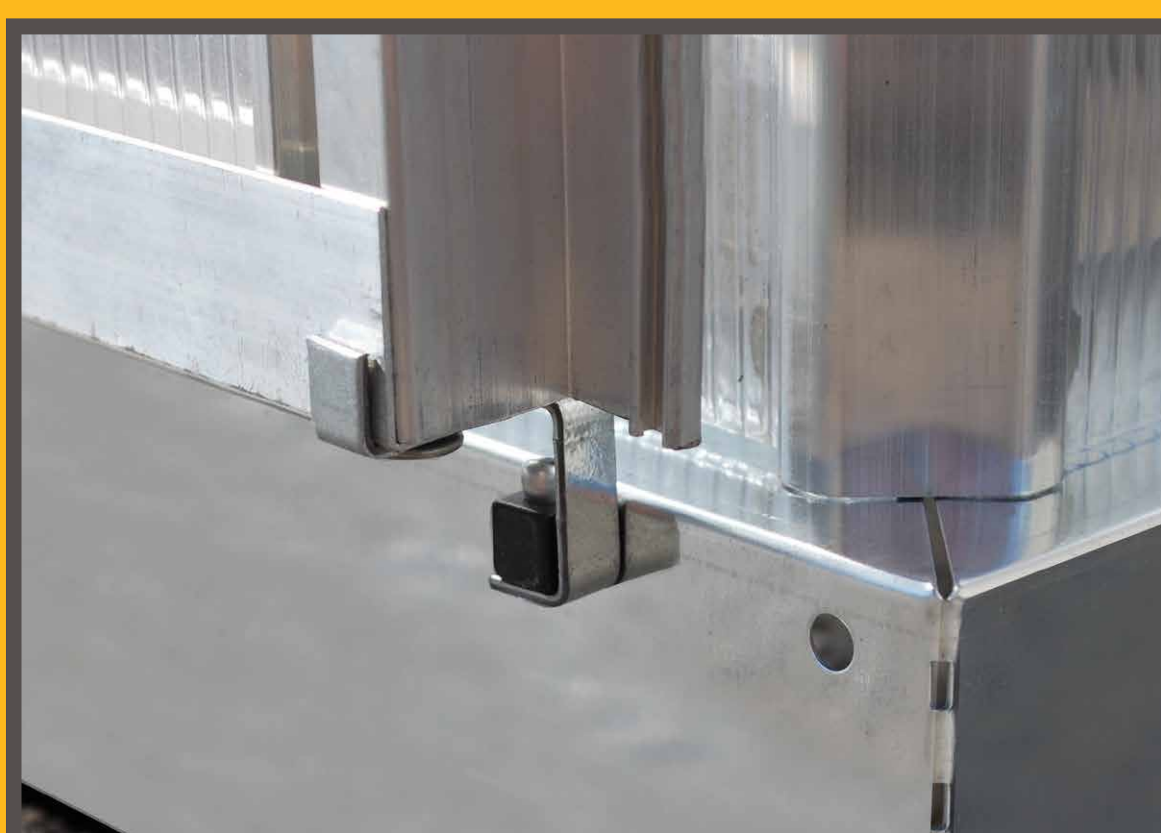
Magnetic door catch & galvanized Steel base included