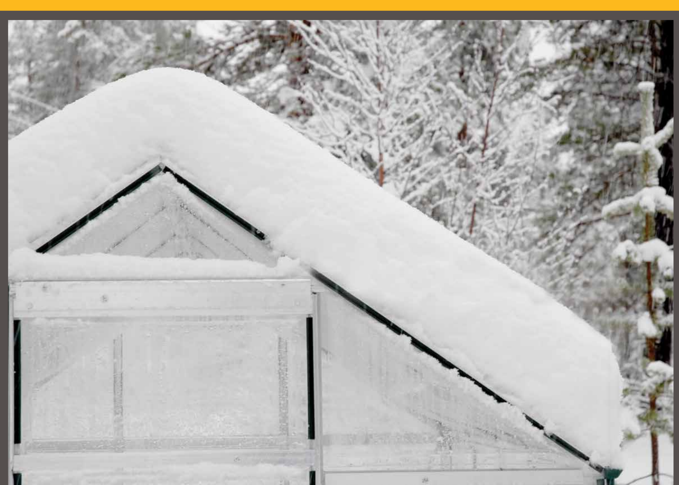
Sturdy frame for long lasting durability