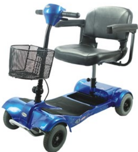
Compact 4 Wheel Scooter ES4100