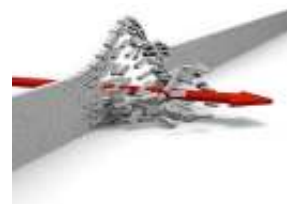
GET IT DONE