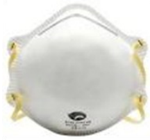
EP004 FFP1 SABS APPROVED DUSTMASK 20 PER BOX