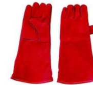
G028 RED HEAT RESIST GLOVE ELBOW KEVLAR STITCH