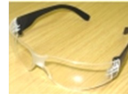
SG007 CLEAR SPECTACLE SPORTY STYLE