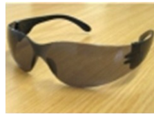
SG007GL GREY SPECTACLE SPORTY STYLE