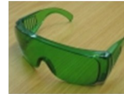
SG004G WRAPROUND SPECTACLE GREEN