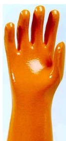
DFS - FULLY DIPPED 27CM NITRILE GLOVE