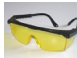
SG006A EURO SPECTACLE AMBER BLACK FRAME