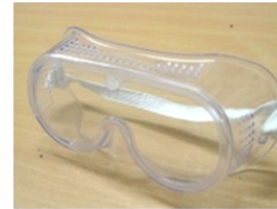
SG001-B CLEAR GRINDING GOGGLE