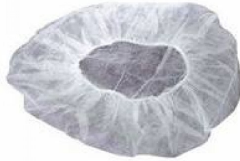
DISPOSABLE MOP CAP NON WOVEN, ELASTISIZED BOX OF 100 PIECES