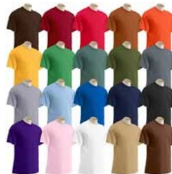
MEN & LADIES CREW NECK T-SHIRTS DURABLE POLY COTTON 145G & 195G.

DOUBLE-NEEDLE FINISH ON SLEEVE & BOTTOM HEM