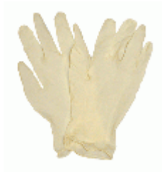
DISPOSABLE EXAMINATION RUBBER LATEX GLOVES, WITH & WITHOUT POWDER BOX OF 50 PIECES

DISPOSABLE PLASTIC APRONS, SHOE COVERS AND SLEEVE, ALL BOXES OF 100 PIECES