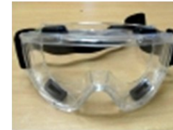
SG010 MAXI VIEW GOGGLE ANTIFOG