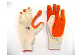
PALM COATED CRAYFISH GLOVES