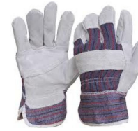
G002 CANDYSTRIPE CHROME LEATHER GLOVE