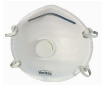
EP005 FFP2 SABS APPROVED DUSTMASK WITH VALVE 20 PER BOX