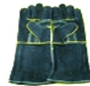
G023/22/22-1 GREEN LINED GLOVE WRIST, ELBOW & SHOULDER