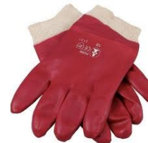
RED PVC GLOVE KNIT WRIST