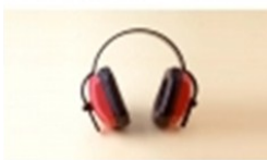
EP002 RED UNIVERSAL EAR MUFF