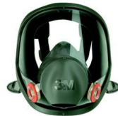
3M FULL FACE MASK