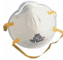
FFP1 3M DUSTMASK 20 PER BOX