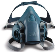
3M HALF MASK