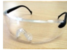
SG009 PROVIEW SPECTACLE CLEAR