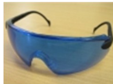
SG009B PROVIEW SPECTACLE BLUE