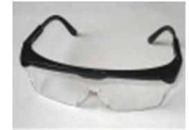
SG006 EURO SPECTACLE CLEAR BLACK FRAME