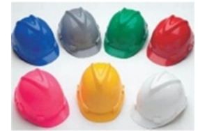
H001 HARD HAT SABS APPROVED ALL COLOURS