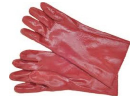
G016 RED PVC GLOVE 35 & 40cm OPENCUFF