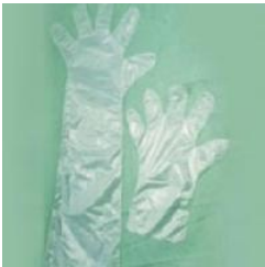
DISPOSABLE DELI GLOVES CLEAR PLASTIC 100 PER PACK