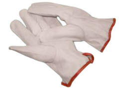
G012-1 VIP TIG WELDING GLOVE GOATSKIN A GRADE