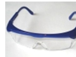
SG006-B EURO SPECTACLE CLEAR BLUE FRAME