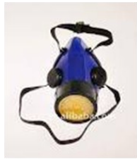
RS002 SINGLE CARTRIDGE RESPIRATOR SABS