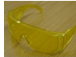
SG004A WRAPROUND SPECTACLE AMBER