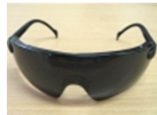
SG009GL PROVIEW SPECTACLE GREY