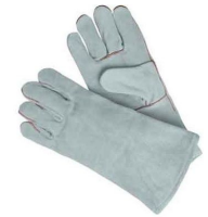
CHROME LEATHER DOUBLE PALM GLOVE WRIST, ELBOW & SHOLDER