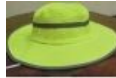
REFLECTIVE FLOPPY CAP LIME & ORANGE