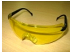
SG009A PROVIEW SPECTACLE AMBER