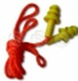
EP001 REUSABLE EAR PLUG SILICONE