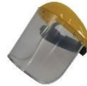
FACE SHIELD CLEAR WITH REPLACABLE VISOR