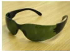
SG007G GREEN SPECTACLE SPORTY STYLE