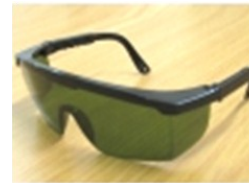
SG006GL EURO SPECTACLE GREY BLACK FRAME