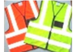
V023Y/V023O LIME & ORANGE REFLECTIVE VEST ZIP & ID POCKET