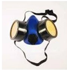
RS002 DOUBLE CARTRIDGE RESPIRATOR SABS