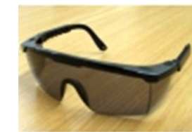
SG006GL EURO SPECTACLE GREY BLACK FRAME