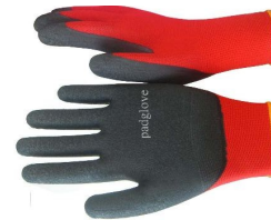
TYSON GRIPTEX GLOVES HEAVY DUTY GENERAL PURPOSE