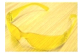
SG007A AMBER SPECTACLE SPORTY STYLE