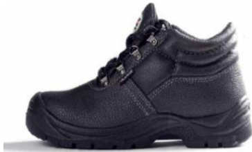
DOT Granite safety Boots SABS approved sizes 3-13