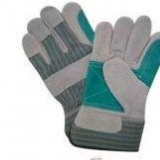
G010 CHROME LEATHERCANDYSTRIPE GLOVE