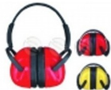
EP003 RED EAR MUFF FOLDUP TYPE