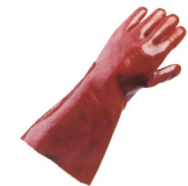
G013-G BROWN PVC HEAVY DUTY GLOVE PIT BULL ELBOW