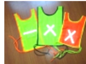
V014Y/V014O LIME & ORANGE REFLECTIVE MAXI BIB