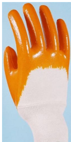
LOK - PALM DIPPED KNITWRIST NITRILE GLOVE