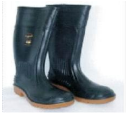
GUMBOOTS STC & NSTC