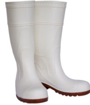
WHITE, RED SOLE GUMBOOTS OIL RESISTANT NSTC

WIDE VARIETY OF BRANDED SAFETY GUMBOOT, BOOTS & SHOES