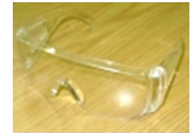
SG004 WRAPROUND SPECTACLE CLEAR