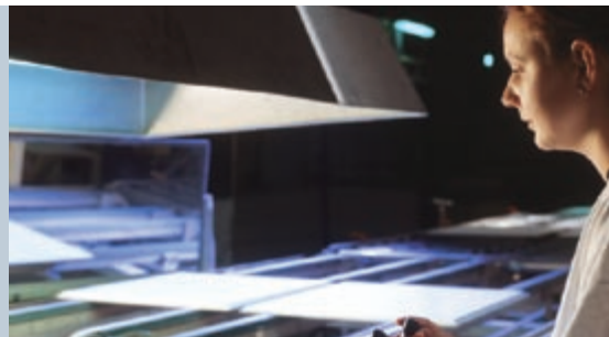
Constant controls and monitoring ensure OWA quality