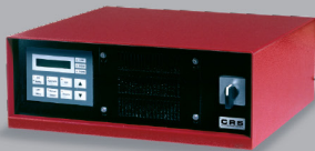
12V/500A DC mini air cooled, 400VAC