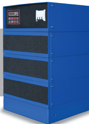
12V/2000A DC air cooled, 400VAC