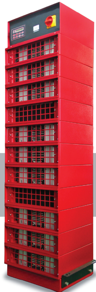
12V/6000A DC air cooled, 400VAC