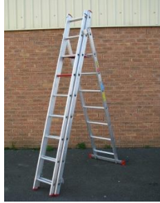
5 IN 1 COMB LADDER