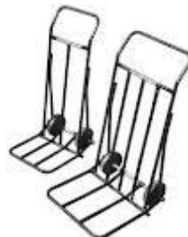
FNH2/3 Folding Nose