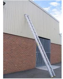
H/DUTY EXTN LADDER