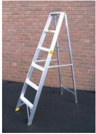
L/D STEP LADDER