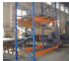
H/D INDUSTRIAL RACKING

CONTACT US FOR ALL YOUR ACCESS AND MOBILITY PRODUCTS