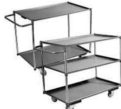
2/3 Tier Trolleys