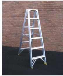
D/SIDED STEP LADDER