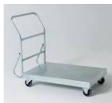
Flat bed Trolley