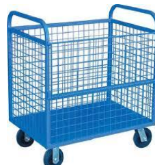
Wire Mesh Trolley