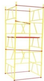
TUBULAR STEEL AVAILABLE WITH LOCKABLE CASTOR