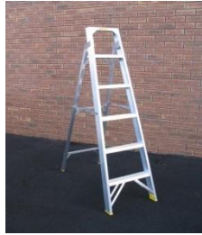
H/D STEP LADDER