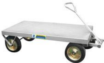
HTL5/7 Turntable Truck