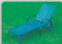
Cottage Pool Lounger