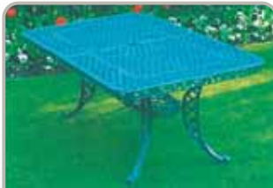
6 Seater Cottage Table