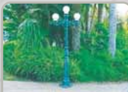
3 Lamp Post