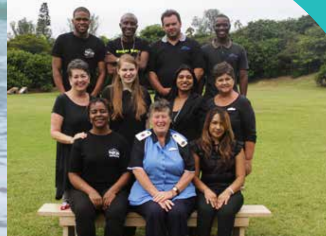
Our full time professional team.