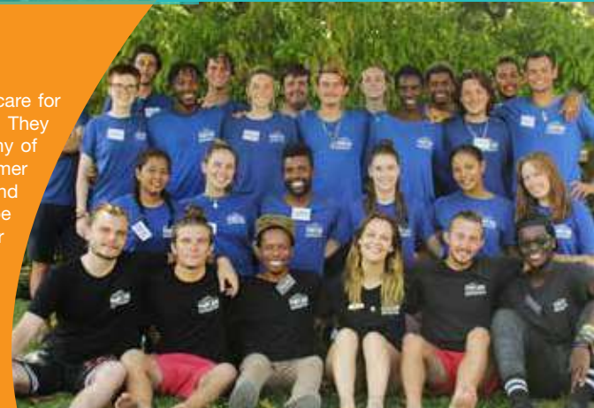
Role model, mentor, trusted friend.

The young adults who are chosen to care for the children are called "counselors". They come from all over the world and many of them have worked in American summer camps. Their crazy nicknames and playful personalities set a great vibe and bring a lot of excitement to Sugar Bay. Their first priority is the care, supervision and happiness of every child. Counselors are an integral part of the Sugar Bay experience. They are actively involved in instructing the activities, and ensure that everyone is helped and encouraged to reach their highest potential, whatever their ability.