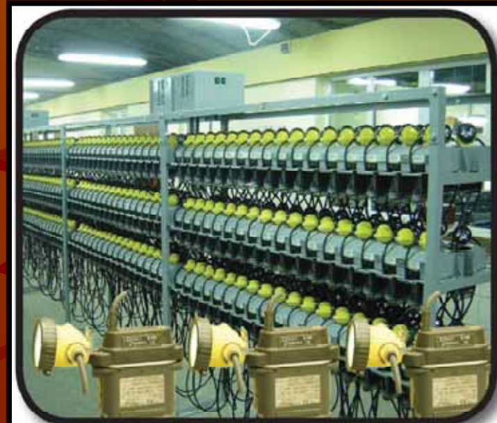
CAP LAMPS SEARCHABLE