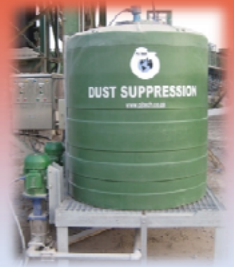
TANK WITH PUMPS