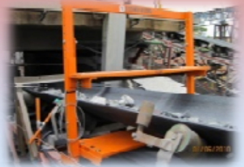
ANTENNA SEARCH FRAME ASSEMBLY