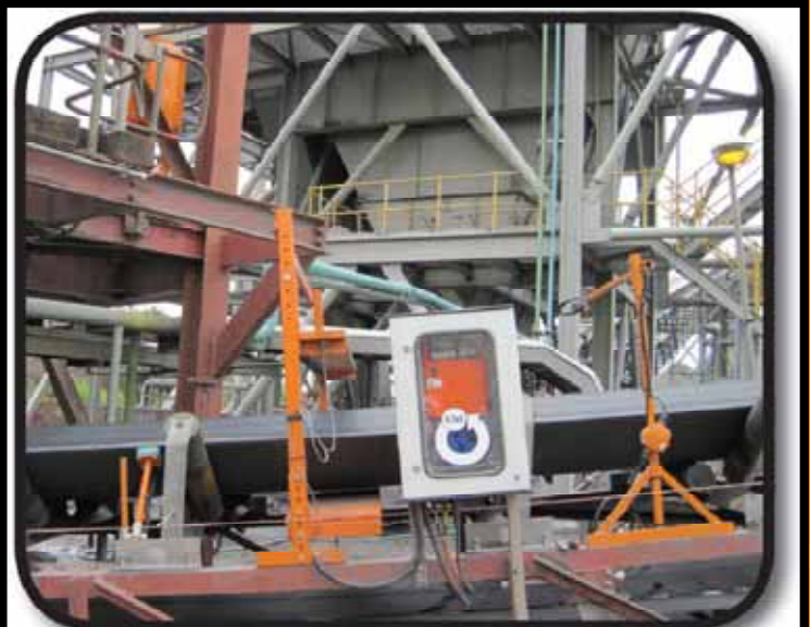
TRAMP METAL DETECTION