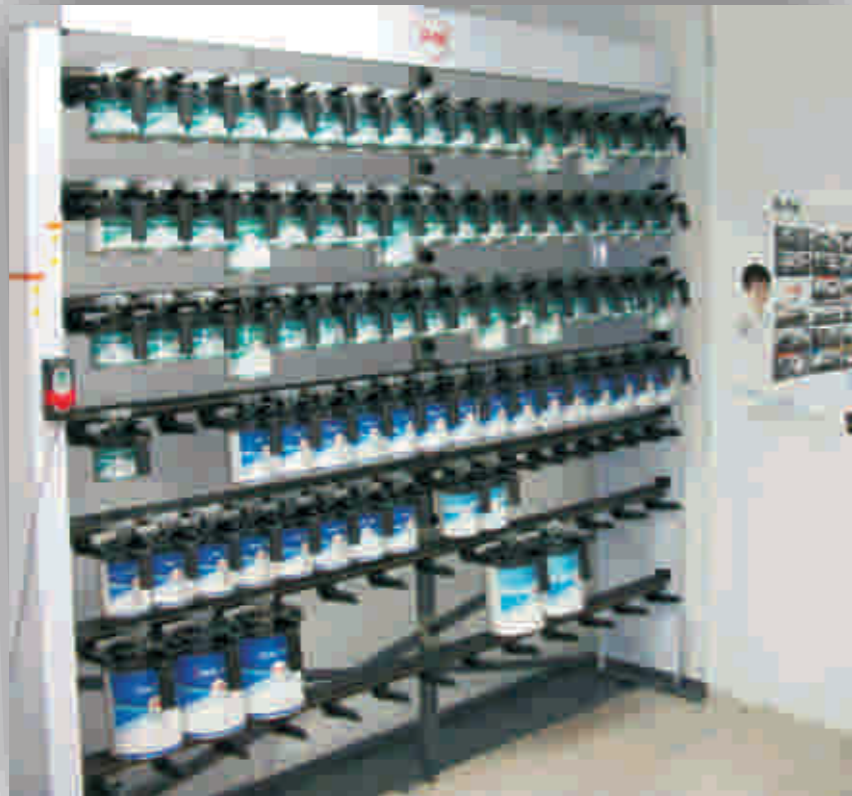
COMPUTERISED COLOUR MATCHING